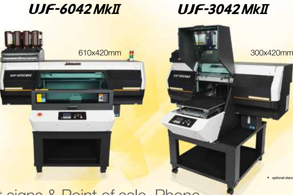
* optional stand shown for both models