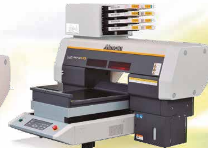
Additional print head + increased print height facilitates wider range of media.